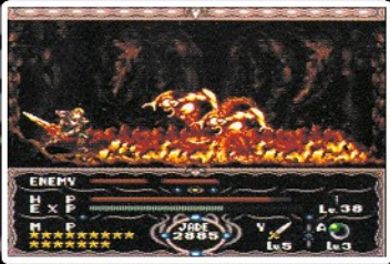
INTENSE BATTLE SEQUENCES